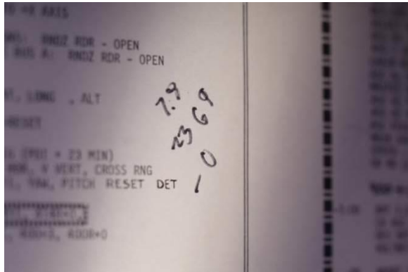
Detail of the landing coordinates, the first writing on the Moon