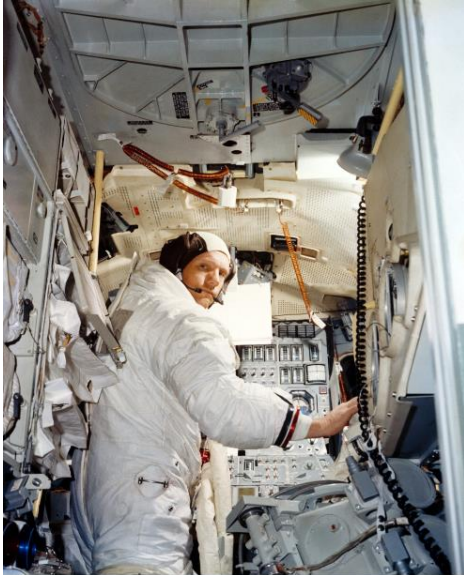
COMMANDER ARMSTRONG IN LUNAR MODULE SIMULATOR THE MONTH BEFORE LAUNCH